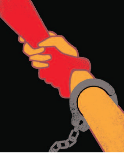
Graphic Design : Cédric Gatillon / HM Studio © 2020

On 10 October 2020, the World Coalition Against the Death Penalty and abolitionist organizations around the world will celebrate the 18 th World Day Against the Death Penalty.