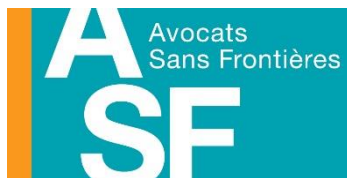
OBSERVATOIRE INTERNATIONAL DES AVOCATS EN DANGER